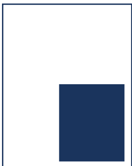
1/3 page square 4.625" x 4.875"